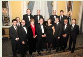
BEYER BLINDER BELLE ARCHITECTS & PLANNERS LLP

'Tis the Season to Give to the League! Pay it forward...and backward!