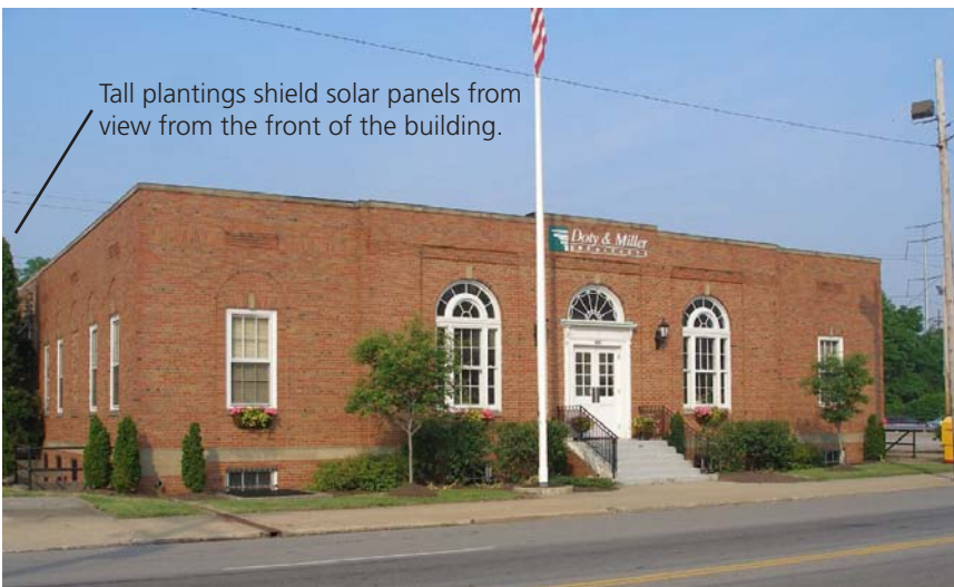
Tall plantings shield solar panels from view from the front of the building.