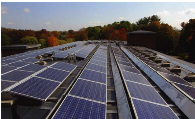
Solar panels installed on the flat roof.