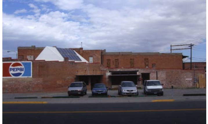
The addition of a large rooftop monitor featuring skylights on the front slope and solar panels on the rear slope is not compatible with the historic character of this small, one-story commercial building.

Application 3 ( Compatible treatment ): The rehabilitation of this historic post office incorporated solar panels as dual-function features: generation of electricity and shading for south-facing windows. In this instance, the southern elevation of the building is also a secondary elevation with limited visibility from the public right of way. Additionally, because this area of the building is immediately next to the post office’s loading dock, it has a more utilitarian character than the primary facades and, therefore, can better accommodate solar panels. Because the panels are in a suitable location at the rear of the property and are appropriately sized to serve as awnings, they do not affect the overall historic character of the property. Additionally, a screen of tall plantings shields the solar panels from view from the front of the building, further limiting their visibility.