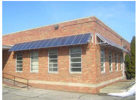
Above: Shown from the rear of the property, these solar panels serve a secondary function as awnings to shade south-facing windows. Because of their location at the back of the building immediately adjacent to a loading dock, the installation of these panels does not affect the historic character of the property.

Application 3 ( Compatible treatment ): The rehabilitation of this historic post office incorporated solar panels as dual-function features: generation of electricity and shading for south-facing windows. In this instance, the southern elevation of the building is also a secondary elevation with limited visibility from the public right of way. Additionally, because this area of the building is immediately next to the post office’s loading dock, it has a more utilitarian character than the primary facades and, therefore, can better accommodate solar panels. Because the panels are in a suitable location at the rear of the property and are appropriately sized to serve as awnings, they do not affect the overall historic character of the property. Additionally, a screen of tall plantings shields the solar panels from view from the front of the building, further limiting their visibility.