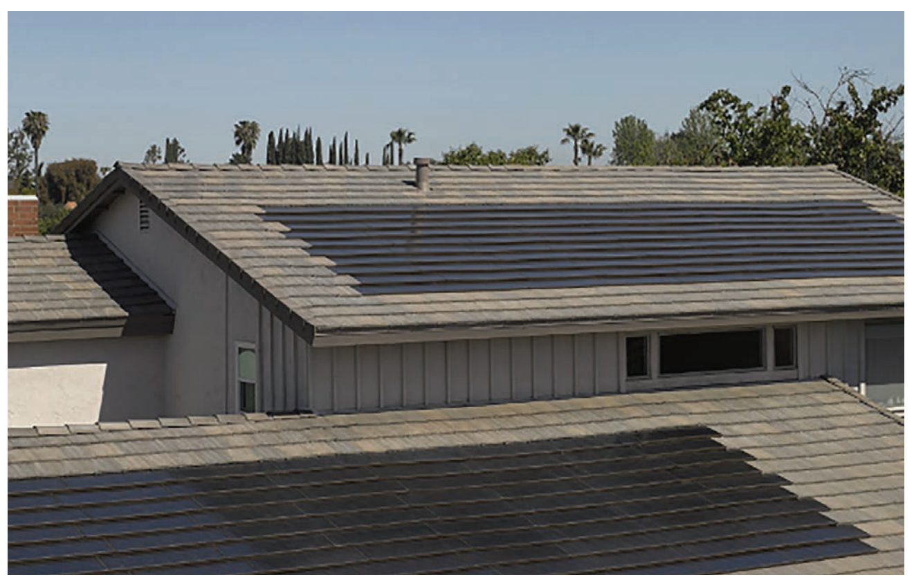
CertainTeed's Apollo II solar shingles

One company that is still trying the CIGS thin-film route is flexible panel manufacturer Sunflare. The company brought prototype four-cell solar shingles to Solar Power International 2018 and expects to have a finalized product by 2021 (as confirmed to Solar Power World). It's unclear by looking at the prototype shingles whether the product would be installed with traditional roofing shingles or as a full roof, but Sunflare said it will focus on new roof installations.