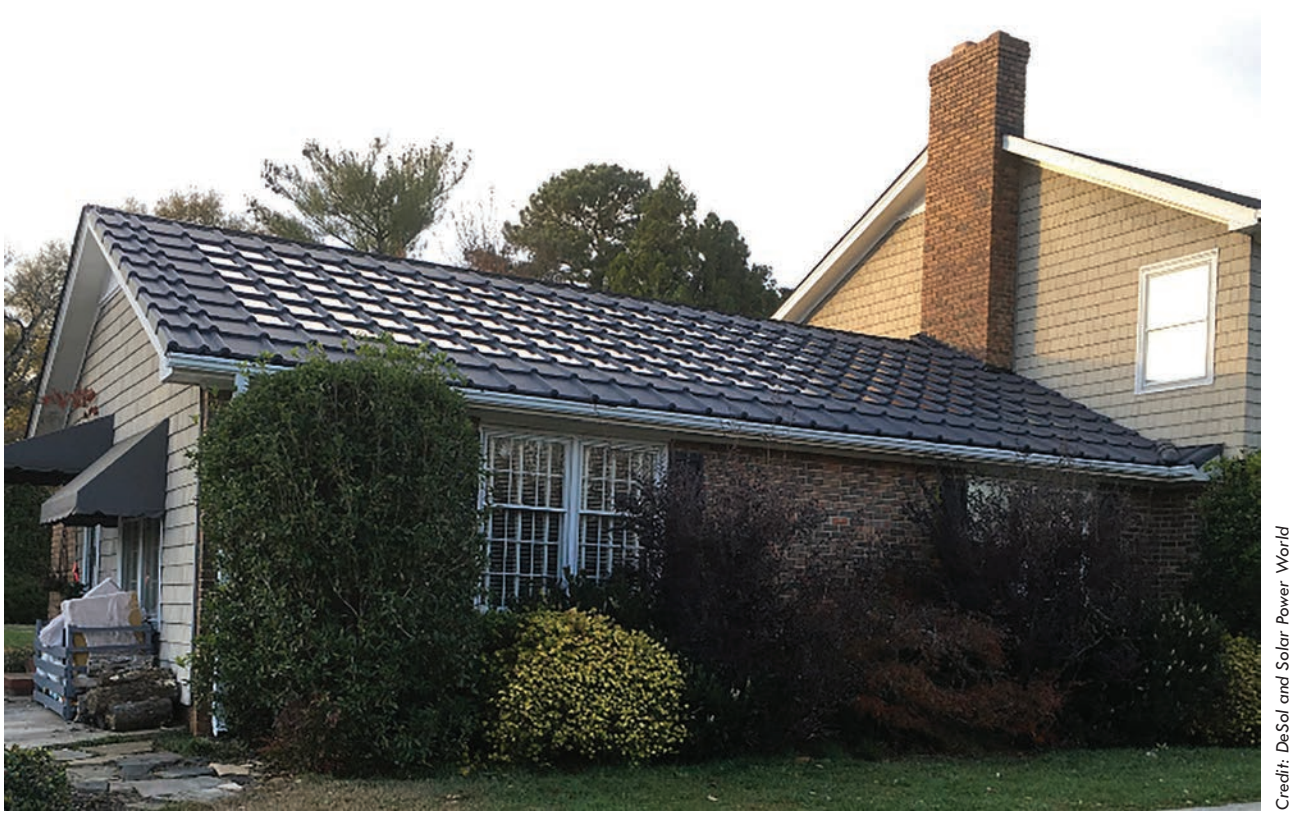
A DeSol Power Tiles installation.