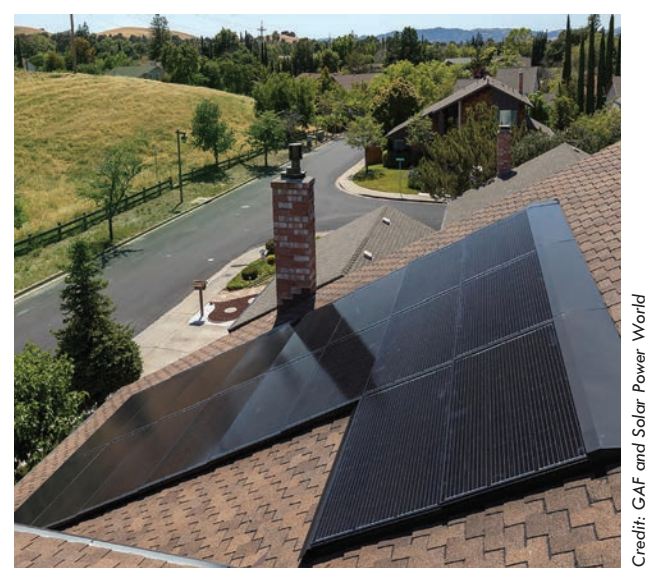
GAF's DecoTech product.