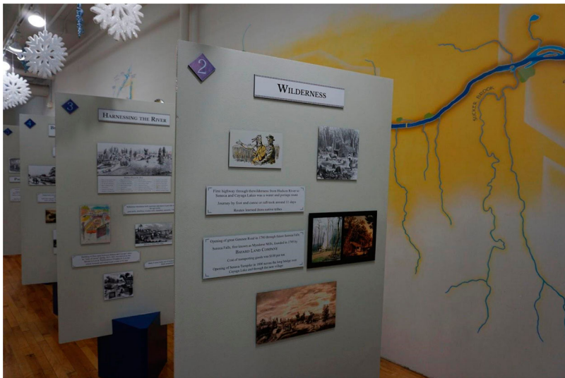
Figure 1. Wilderness and Harnessing the River.

Construction began in 1817. The many labourers of the Erie Canal are seen as Man in an epic battle with Nature. Students of “America’s first engineering school” learned how to “tame the wilderness” and “defy nature”. Canal construction involved the dangerous labour of deforestation, blasting through limestone with black powder, and upheaving environments that were long stewarded by and taken from the Haudenosaunee. In the dominant Erie Canal discourse, transforming the wilderness is often legitimised with religious language and fits within larger Christian ideologies like “Manifest destiny”, the “Doctrine of Discovery”, and “Divine Providence” (Plate 2017). Rivers are described as “intended by the Almighty for feeding canals”, canal construction as evoking “feelings of gratitude to that Being who has bestowed to his creatures so much power and wisdom”. In other words, this discourse claims that “Progress was God’s sanction” (Plate 2017).