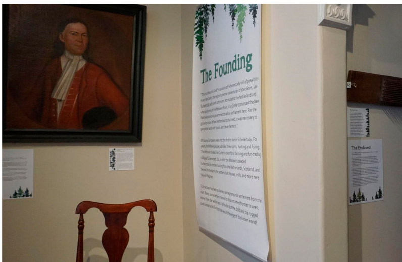
Figure 2. The Founding and the Enslaved.

In the centre of the exhibit shown in Figure 2 is a panel communicating how "Colonial Schenectady is the story of the American spirit; the birth of a worldview we hold dear today". Yet, around a corner on a small shadowed piece of paper (seen on right) is the statement: "Slavery existed at the heart of colonial Schenectady". The extreme tension between a centred colonial worldview and the marginalised details of its racialised chattel slavery are visible in the space. Around the room are three large framed portraits featuring a White man, a White woman, and a young White boy. Behind a corner, a wool card is used to represent "the Enslaved". "It is likely", the artefact's description reads, "that Sambo assisted with the Sander's family wool processing, using this card. One thing we know for certain about Sambo: he was famous in Schenectady for his dancing skills".