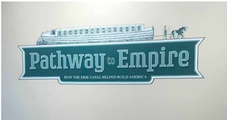
Figure 3. Nationhood in the heritage space.

welcoming to visitors (See Figure 3 ). Repeatedly, the Canal is emphasised for how it “opened the interior of North America”, particularly for the “precious cargo” of European immigrants.